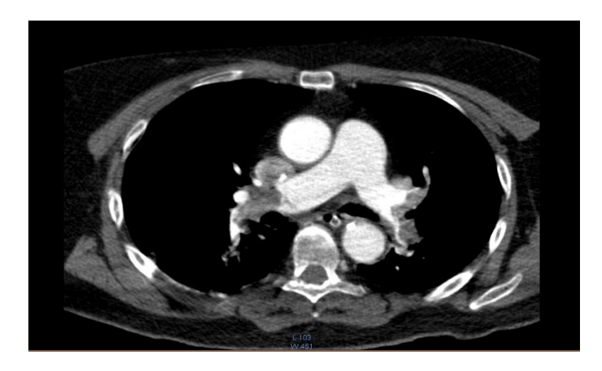
Fig. 3. MSCT-angiography of the pulmonary arteries of patient N; 56 years old