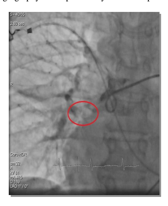
Fig. 4. Introduction of the rotary fragmentation Pig-Tail for fragmentation of thromboemboli in the pulmonary arteries. Fragmentation thromboemboli in the pulmonary arteries with Xray endovascular control of improved blood flow

65%. Subsequently – uncomplicated during the postoperative period.