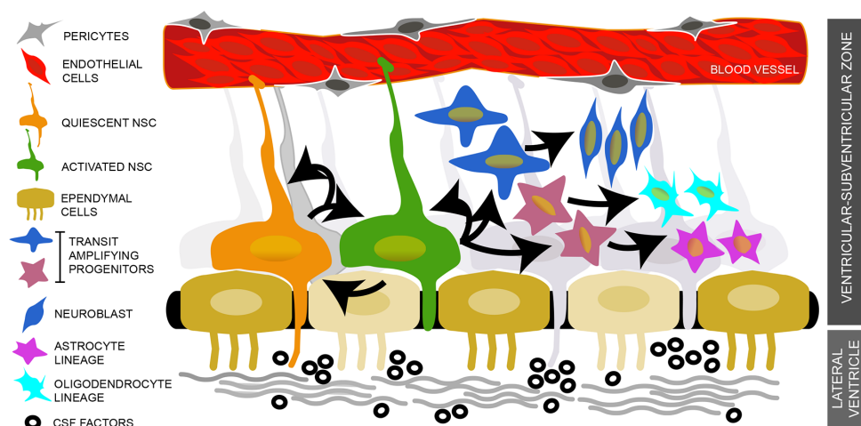
Figure 1. Schematic Diagram of the Ventricular-Subventricular Zone (V-SVZ) Neurogenic Niche. Quiescent and activated neural stem cells (NSC) interact closely with other cell types within the V-SVZ such as the ependymal cells, endothelial cells, pericytes, postmitotic neurons, oligodendrocytes, and astrocytes. Additionally, since NSCs line the lateral ventricles, these cells are in contact with factors present in the cerebrospinal fluid (CSF). The result of these interactions contributes to the proliferative and differentiation capacities of NSCs, which is capable of self-renewal and the generation of lineage-specific transit amplifying cells that will either proliferate or differentiate into neurons or glial cell types.

reviews that provide excellent information on the crucial factors involved in the development and maintenance of the neurogenic niche of the adult brain, including the V-SVZ (Bjornsson et al., 2015; Choe et al., 2016). In this review, we will summarize the roles of molecules that have been specifically implicated in the proliferation of NSCs and BTSCs.